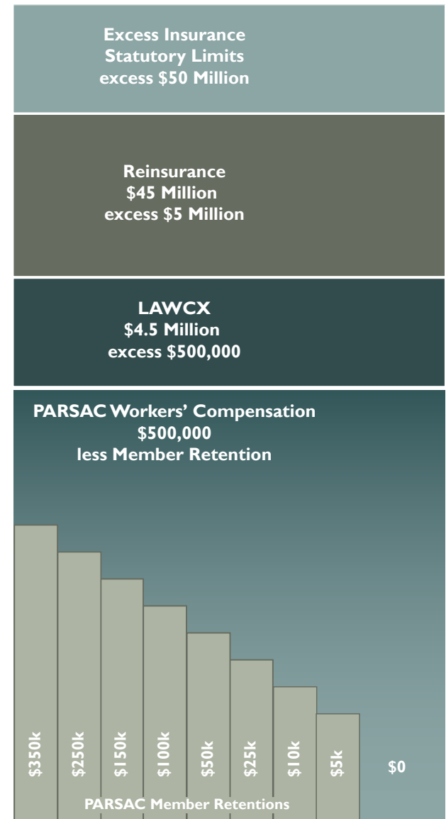
Workers' Compensation Program